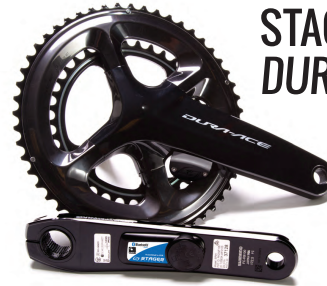
STAGES POWER LR DURA-ACE 9100