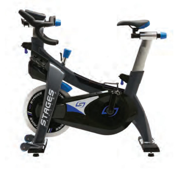
SC3 INDOOR CYCLE WITH POWER METER AND CONSOLE