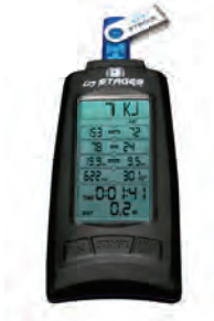
STAGES BLUETOOTH/ANT+ CONSOLE