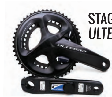
STAGES POWER LR ULTEGRA R8000