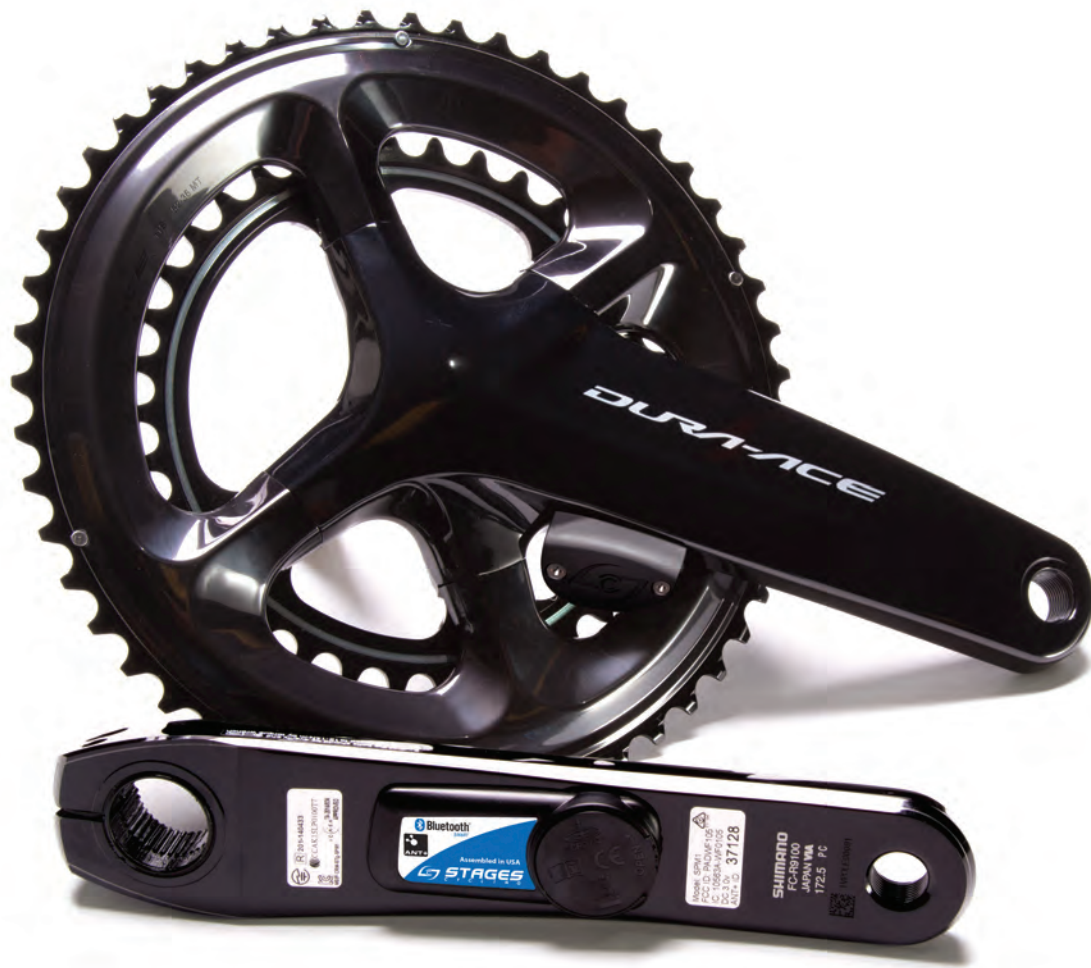
Stages Power LR | Shimano Dura-Ace 9100