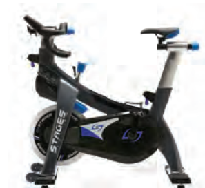
SC2 INDOOR CYCLE